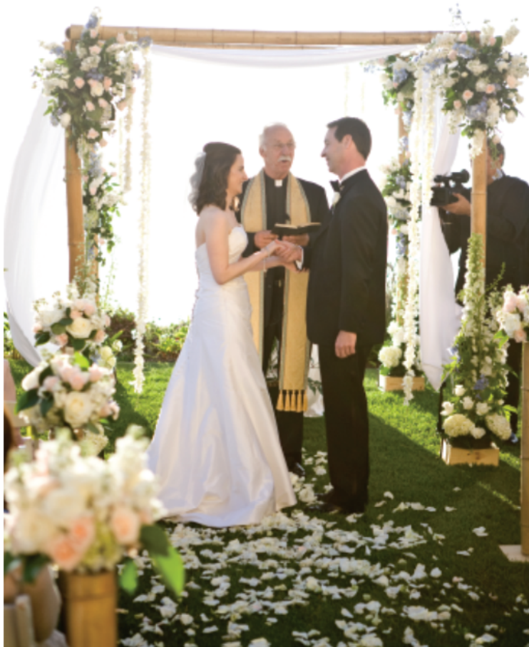
Figure 3 My father, the Episcopal priest, marrying his nonbelieving son to a nice Jewish girl.