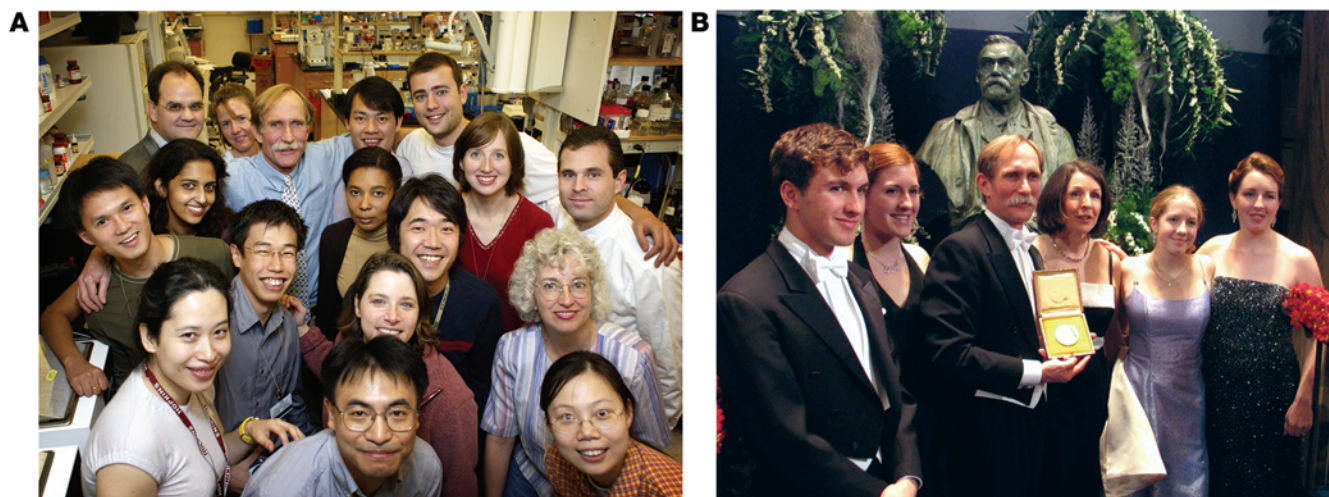
Figure 10. Peter with his lab and his family. (A) The Agre lab on October 8, 2003. (B) Peter with his family at the 2003 Nobel Prize ceremony.

Aquaporins, known as “the plumbing system for cells,” play a role in many physiological processes in humans and are impli-